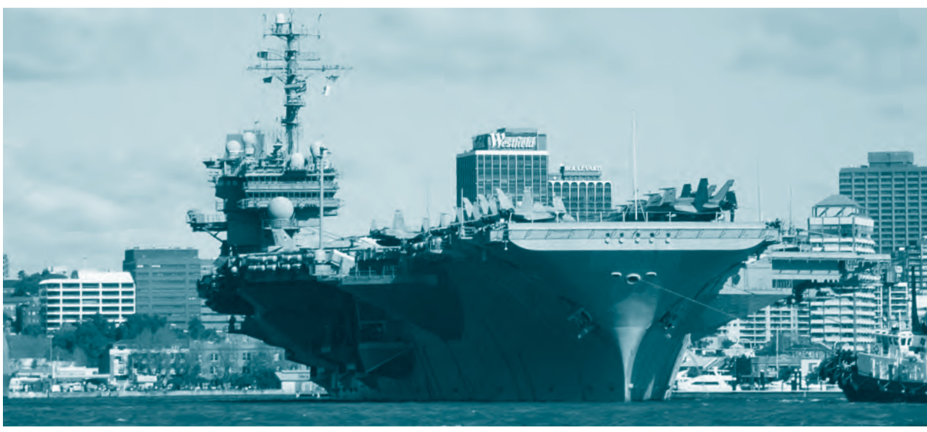
USS Kittyhawk and support fleet on a visit to Garden Island, Sydney.