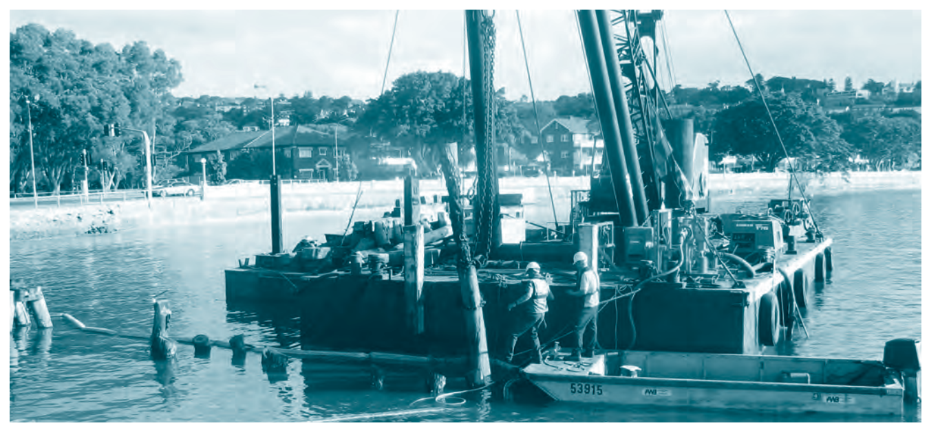
The old and disused former floating restaurant at Rose Bay was removed during the year along with associated navigational obstructions such as timber piles that had been driven into the bed of the harbour.