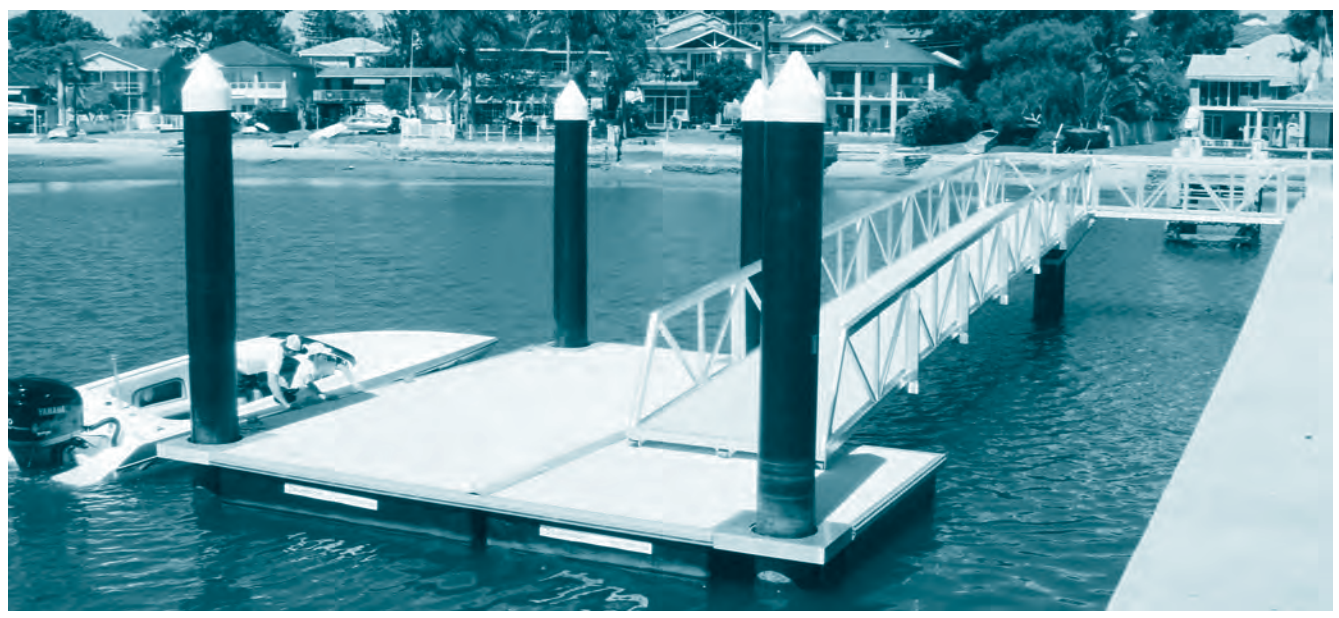
NSW Maritime is helping to build new and to improve boating facilities statewide with its infrastructure grants programs.

navigation aid population, which is currently 3205. The increase in breakdowns is attributed to significant flood damage which accounted for 29.4 per cent of notifications.