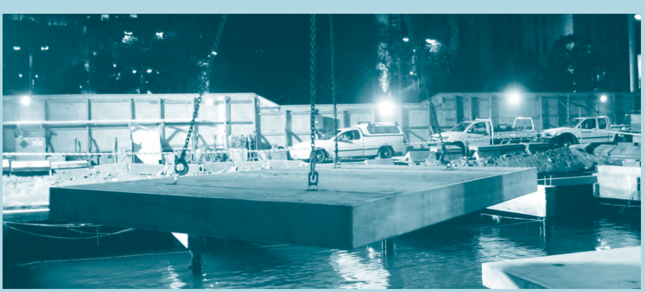
Replacement of skirting and deck panels on the western promenade of Circular Quay were completed during the year.

NSW Maritime has also allocated $1.3 million for enhancements across commuter and charter vessel wharves. These works are to include electrical and lighting, signage and balustrade upgrades.