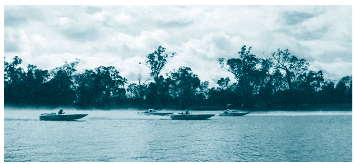
Ski-boats on the Murray River at Mildura. NSW Maritime licenses aquatic events to ensure appropriate safety measures are in place.

• Taskforce members have helped to prioritise infrastructure projects that will improve the efficiency of the freight logistics chain such as rail freight improvements at Botany. A number of port projects were also identified as priorities for Auslink Round II funding such as the duplication of the Botany rail line.