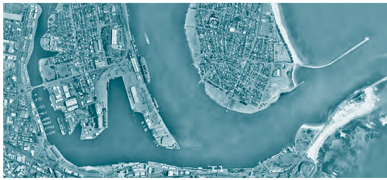
Aerial view of the Port of Newcastle.

The status of the projects being undertaken by the private sector proponents is as follows: