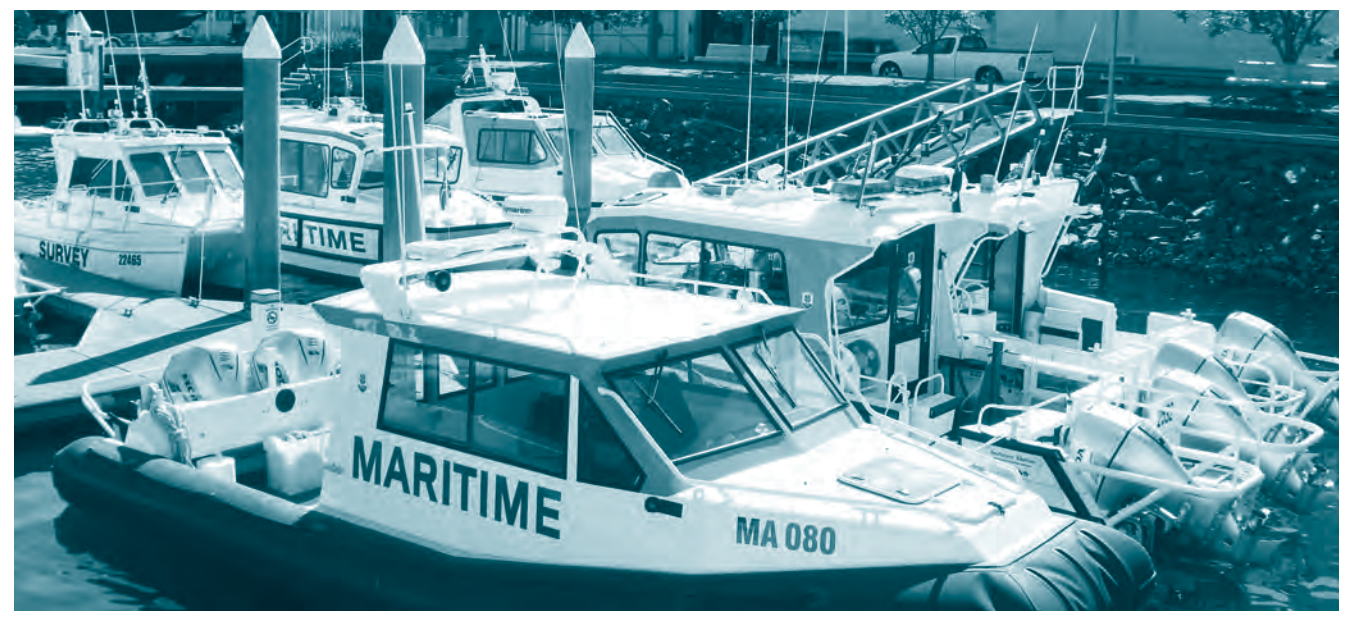
Part of NSW Maritime's fleet of vessel which are used by Boating Safety Officers across the State in their work to improve boating safety culture.

The success and timing of the dredging work relies heavily on the co-ordination of the three companies. NCIG have obtained a sea dumping permit from the Commonwealth Department of the Environment, Water, Heritage and the Arts. BHPB is currently applying for a sea dumping permit for noncontaminated material.